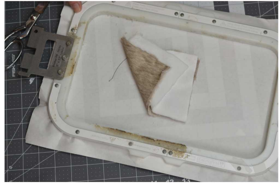
COVER THE EARS DIE LINE WITH TWO PIECES OF FABRIC RIGHT SIDES TOGETHER. I AM USING ONE PIECE OF WHITE MINKY FOR THE INNER EAR AND BROWN SHORT PILE FUR FOR THE OUTER EAR