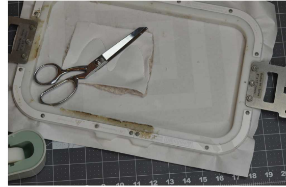
TRIM THE RIGHT SIDE OF THE EAR FABRIC CLOSER TO THE TACK DOWN LINE SO IT WILL NOT BE IN THE WAY OF THE TAIL DIE LINE