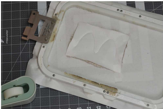
STITCH THE TACK DOWN FOR THE EARS.