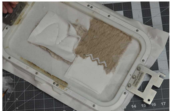
TAPE THE LOOSE FABRIC PANEL IN PLACE OVER THE TAIL