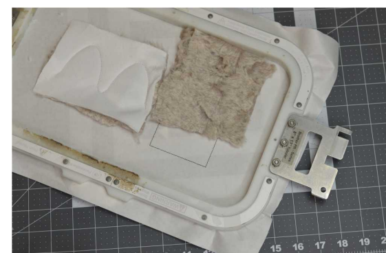
COVER THE ZIG ZAG LINE AND UPPER HALF OF THE RECTANGLE WITH A PIECE OF FABRIC RIGHT SIDE UP AS SHOWN.