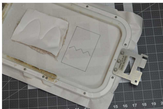
STITCH THE DIE LINES FOR THE TAIL