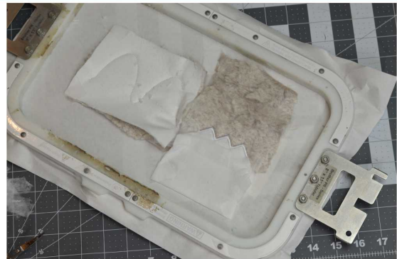
STITCH THE SATIN STITCH FOR THE ZIG ZAG AND THEN REMOVE THE WATER SOLUABLE STABILIZER. ALSO STITCH AN ALL OVER TACK DOWN LINE AROUND THE TAIL (NOT SHOWN)