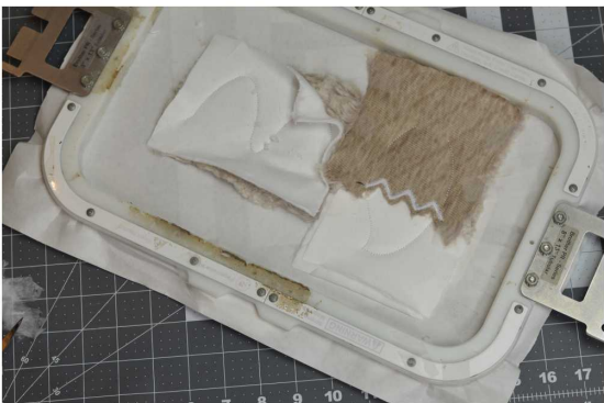
STITCH THE FINAL TACK DOWN LINE