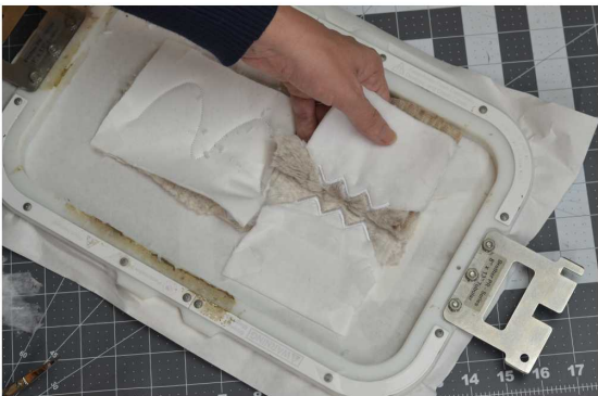
TAKE THE FIRST FABRIC PANEL WE CREATED EARLIER AND PLACE IT RIGHT SIDE DOWN ALIGNING THE ZIGZAGS TO MATCH AS SHOWN