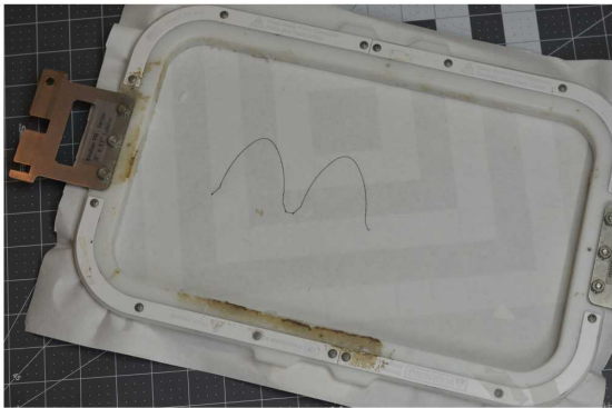
LOAD PART 1 AND STITCH THE DIE LINE ON A PIECE OF STABILIZER