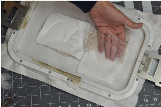
COVER THE ZIG ZAG WITH WATER SOLUABLE STABILIZER